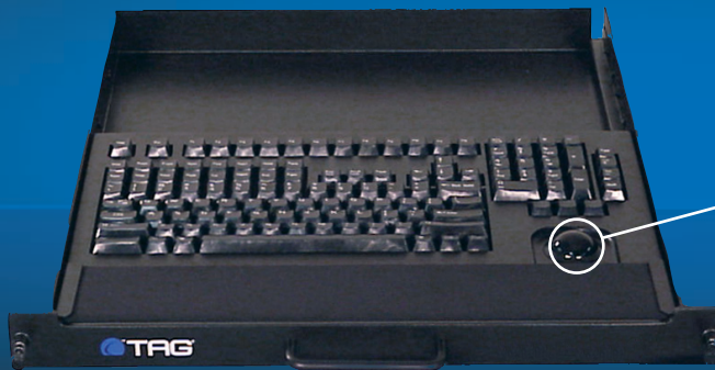
Integrated Track Ball